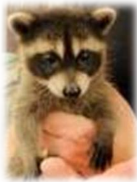
Little “Flower” – One of our past, rescued, rehabilitated, and released raccoons.